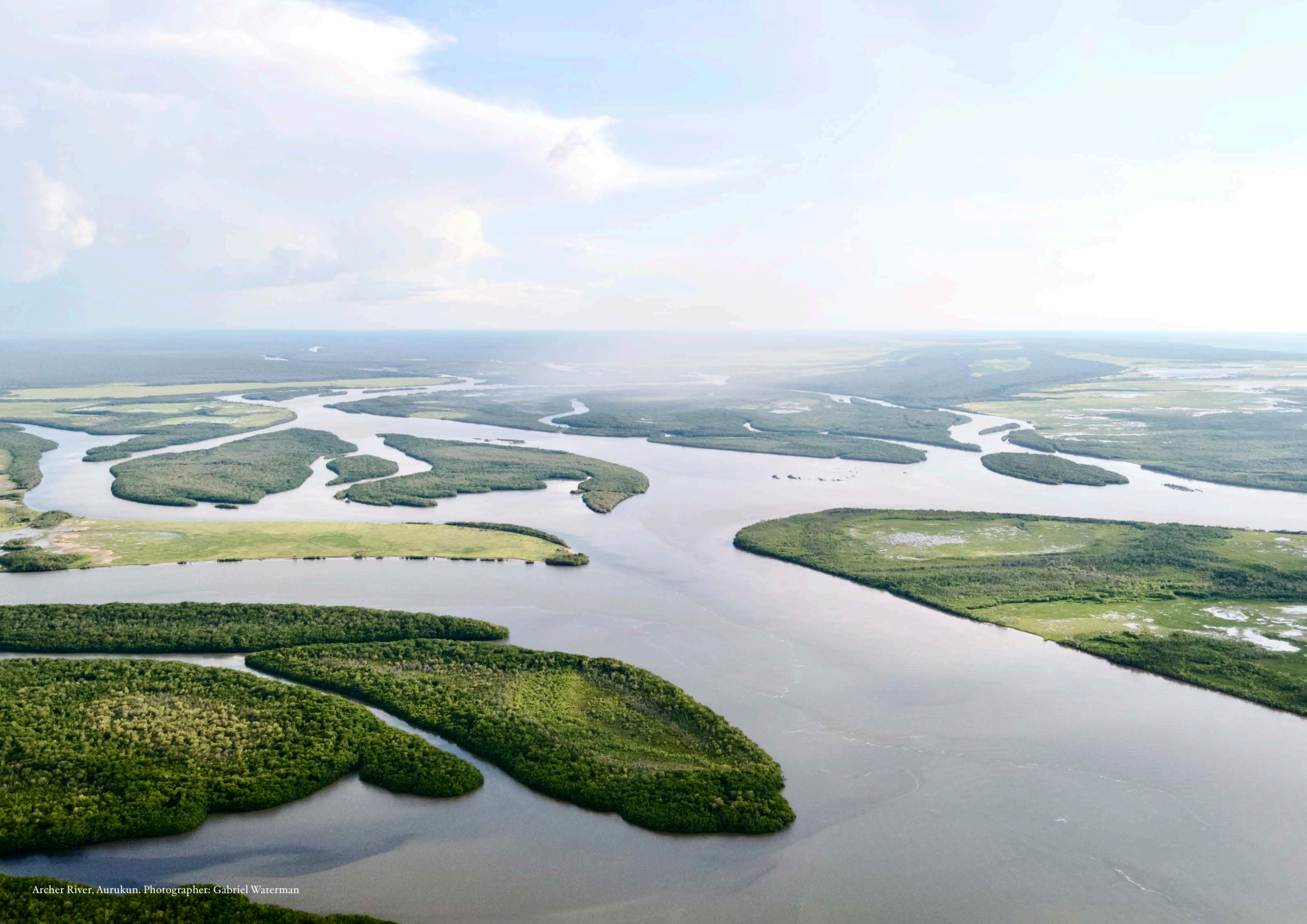
Archer River, Aurukun.